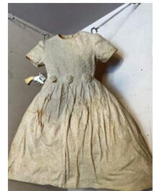
Left: Not a Yayoi Kasuma Right: Sugar and Spice are Not Nice!