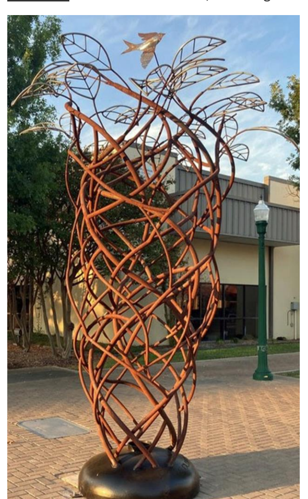
Left: Whirlwind by Tim Glover at the corner of Main and 9th St. (photo credit David Valdez).

map of the Sculpture Tour, and images of the sculptures. To purchase a sculpture, please contact Amanda Still at arts@georgetown.org