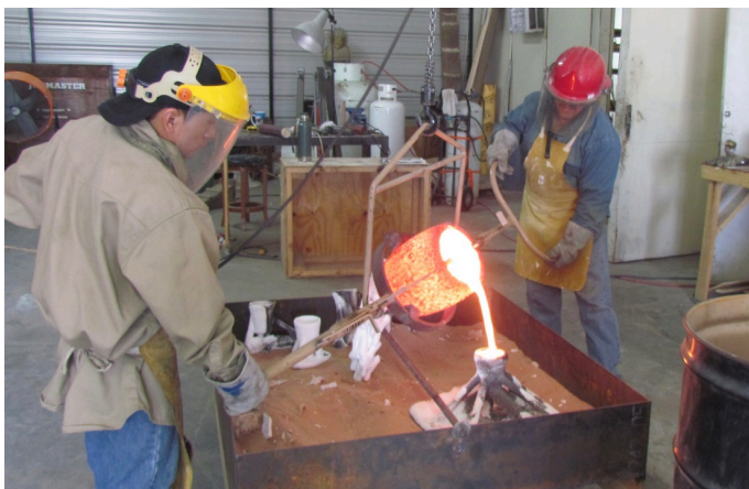
Pouring bronze at the Betz Foundry for an artist.

Sculptors can learn more about how a bronze sculpture is created and this can even save them money.