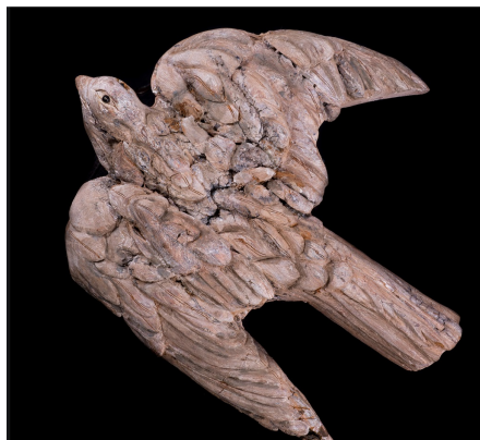
Dove of Peace

The phone number at the Pastoral Center is 512-949-2400.