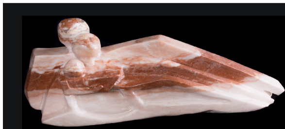
Holy Family - Refugees Rest on the Flight into Egypt

C. D. said..."There are carvings in found wood and in alabaster and I experimented with some bark cavings".