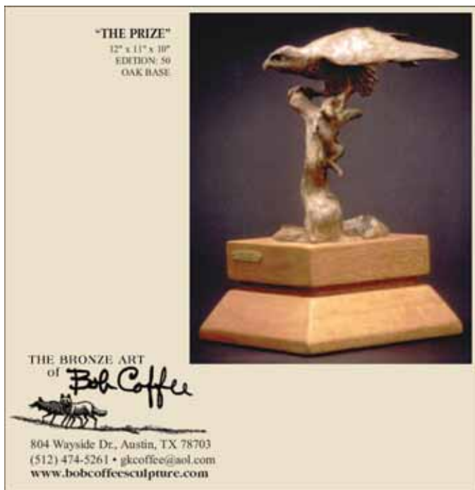
Detail of wine bottle neck advertisement featuring The Prize , Bronze sculpture by Bob Coffee