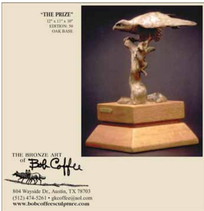
Detail of wine bottle neck advertisement featuring The Prize , Bronze sculpture by Bob Coffee