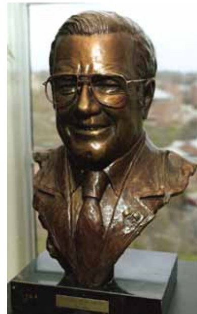
Dan Pogue, Governor Dolph Briscoe, Bronze

Dan Pogue was commissioned by the board of the Briscoe Art Museum to create a bust of former Governor, Dolph Briscoe. It was displayed at the 2009 "Night of Artists" Gala, March 6 th and 7 th in San Antonio. The Museum will be at the location of the old Masonic Hall in downtown San Antonio. The remodeling of the building is slated to be finished in 2010. The Gala is a major fundraiser for the Museum each year. Dan has exhibited in the Night of Artists for five years.