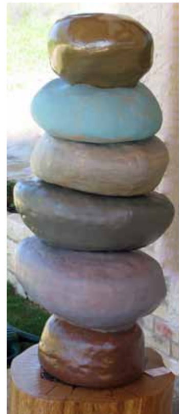
Cass Hook , Stacked 1 , Ceramic sculpture 3rd Place, TSOS Spring '09 Exhibit, Flat Creek Estate Winery, Marble Falls, TX.