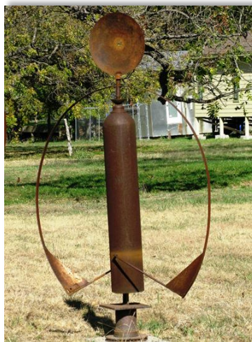
Craig Blaha , Sentinel , Steel, (8' x 5' x 2") 3rd Place Award, Kirchman Gallery, Johnson City, TX